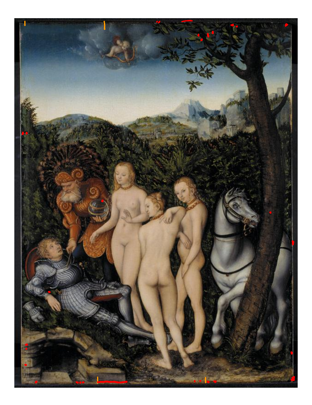
Statens Museum for Kunst National Gallery of Denmark