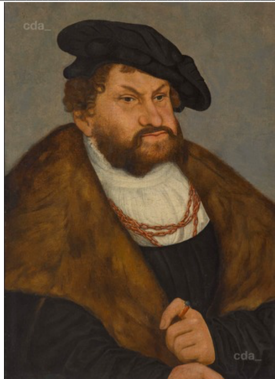
Figure 3. Lucas Cranach the Elder and Workshop, Kurfürst Johann der Beständige von Sachsen, #1532/33.