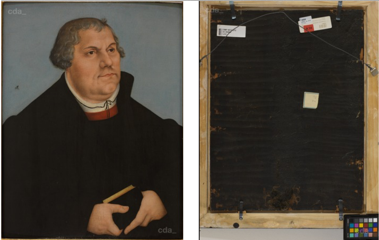
Figure 1. Lucas Cranach the Elder and Workshop, Martin Luther, #1543/46 and verso where samples were obtained.